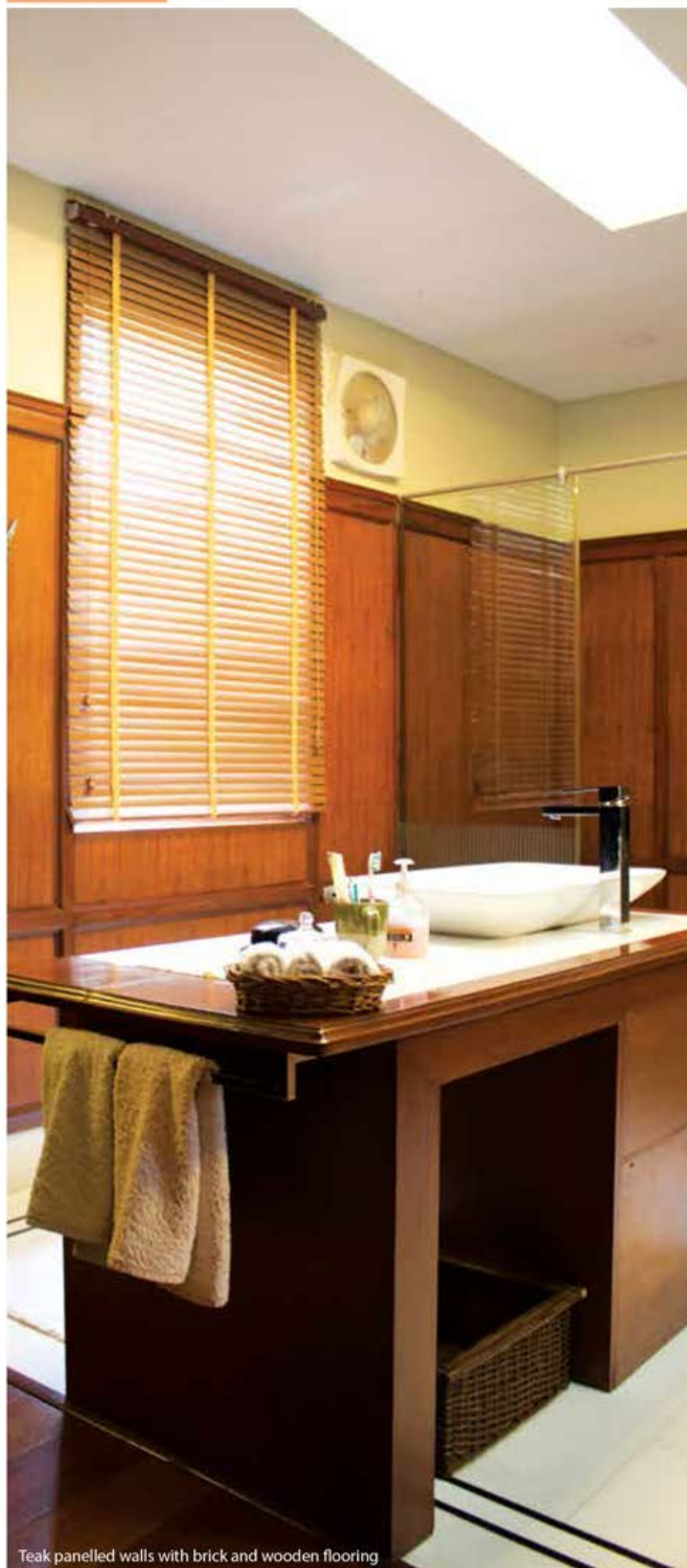
Teak panelled walls with brick and wooden flooring

“The house brings out a profound rustic reminiscence of the golden age, where the architectural innovations were a prominent process of perfection and secretive innovations”