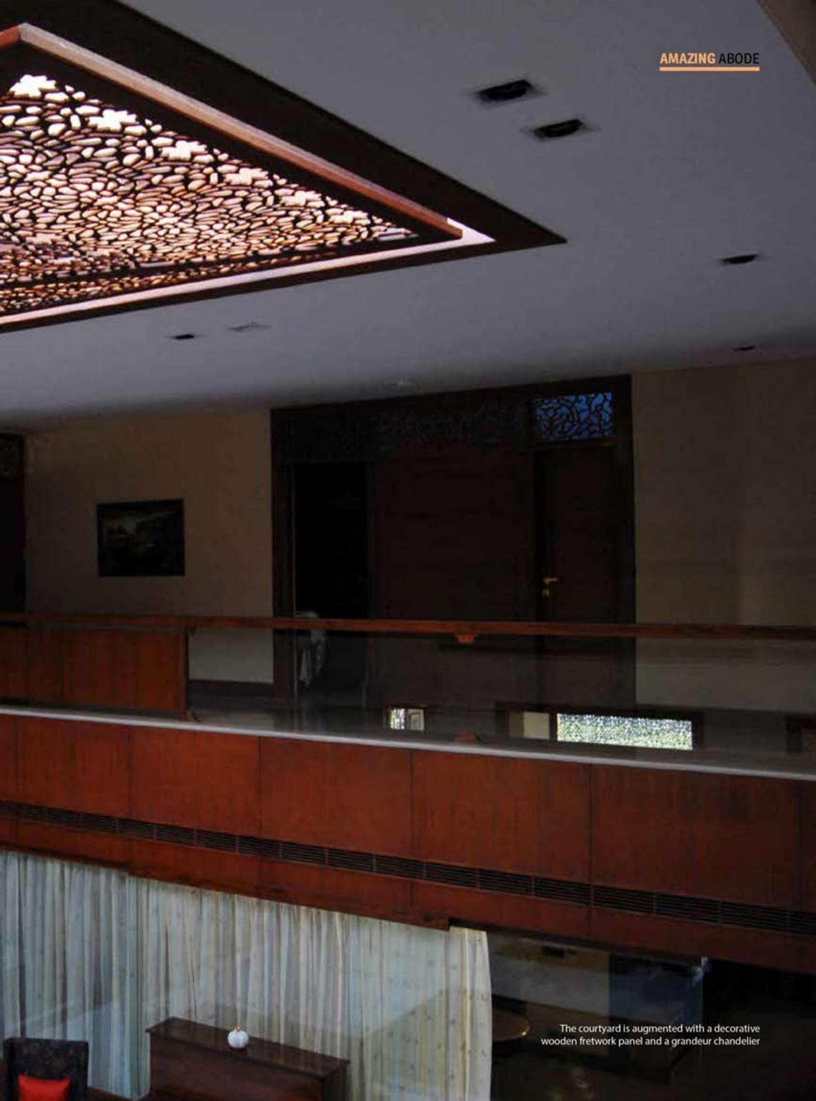
The courtyard is augmented with a decorative wooden fretwork panel and a grandeur chandelier