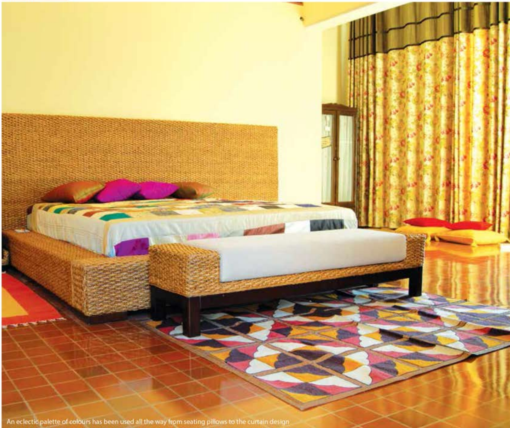
An eclectic palette of colours has been used all the way from seating pillows to the curtain design