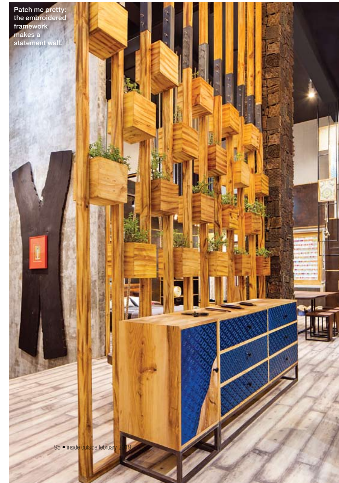
Patch me pretty: the embroidered framework makes a statement wall.