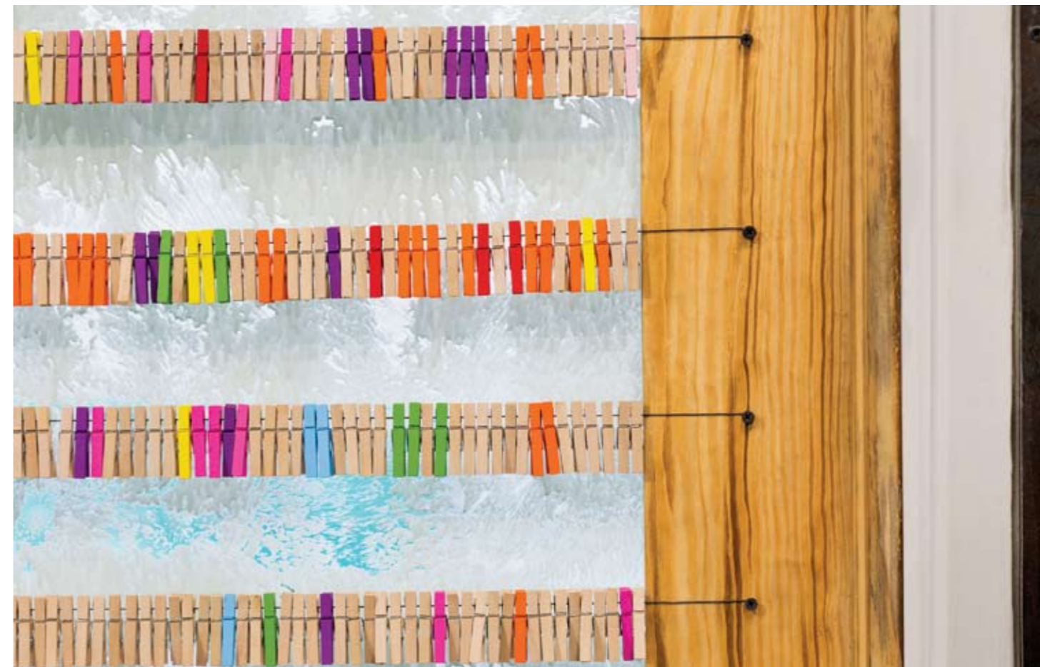
Tassels to drapes, lamp fixtures to fabric; RR Décor has it all!

these units valuing design and art have come together to create the luxe factor of RR Décor.