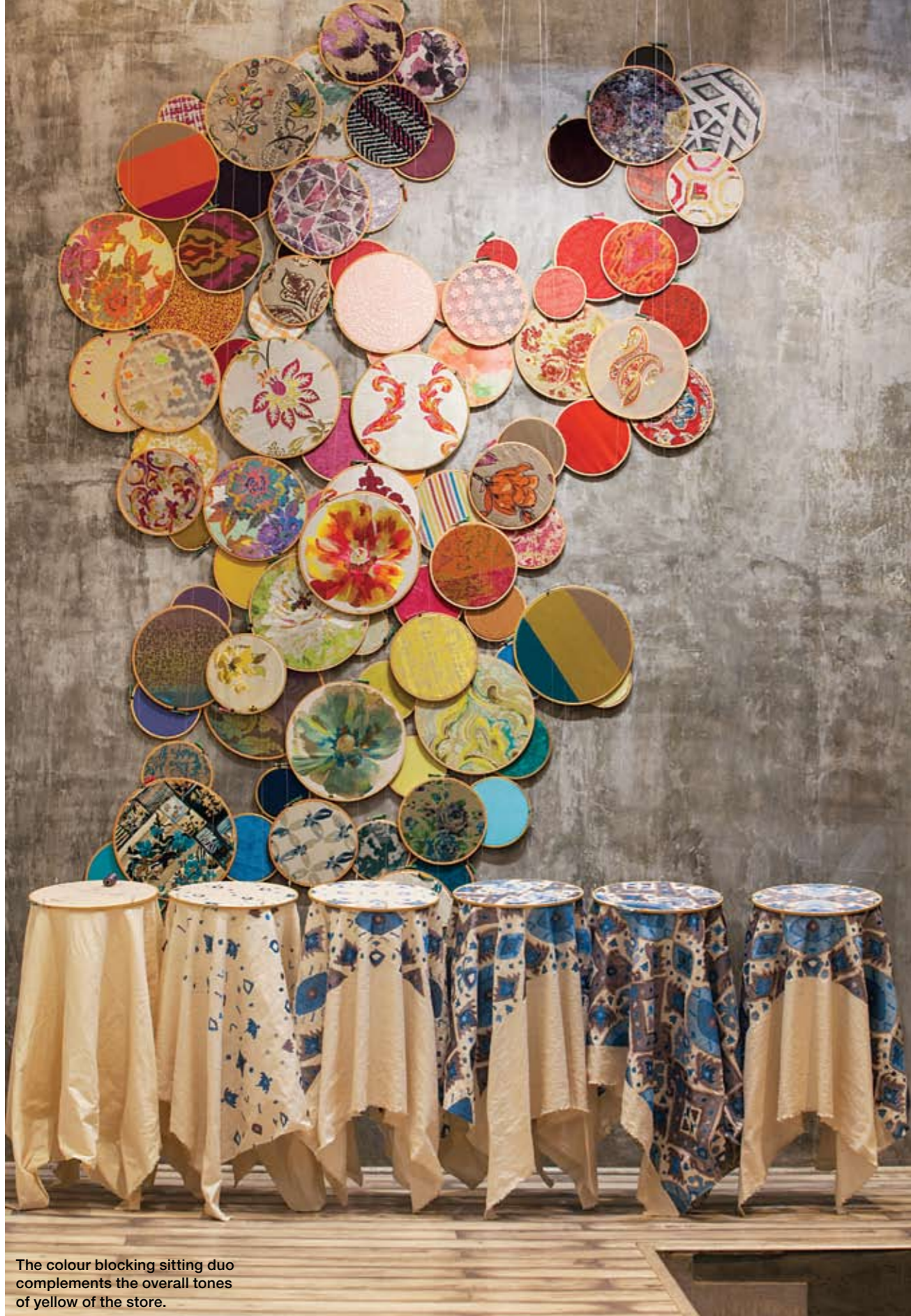
The colour blocking sitting duo complements the overall tones of yellow of the store.