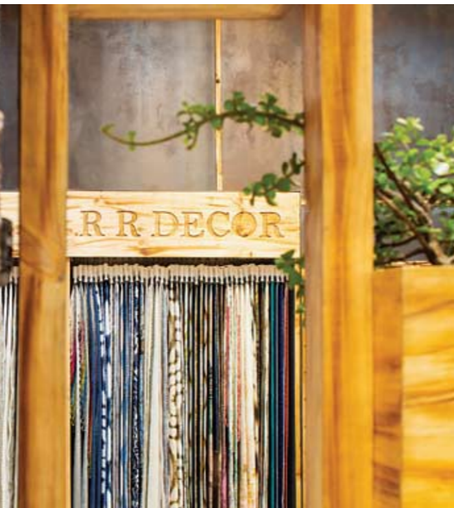
Blocks and hieroglyphics are classic and stylish.